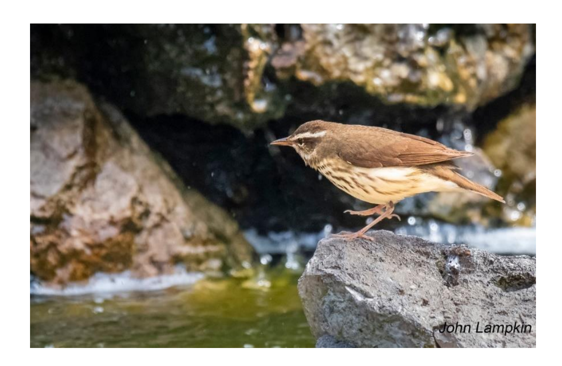
"It's bath time." Louisiana Waterthrush

A rose-breasted Grosbeak peeking around the twigs.