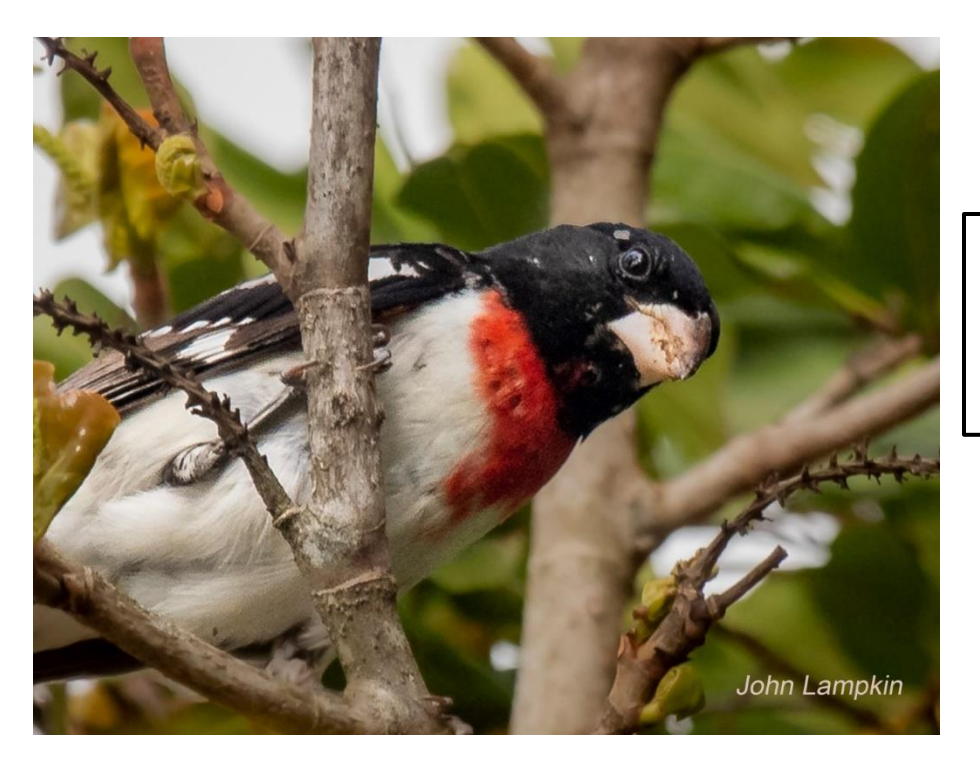
"Peek a boo, I see you."

A rose-breasted Grosbeak peeking around the twigs.